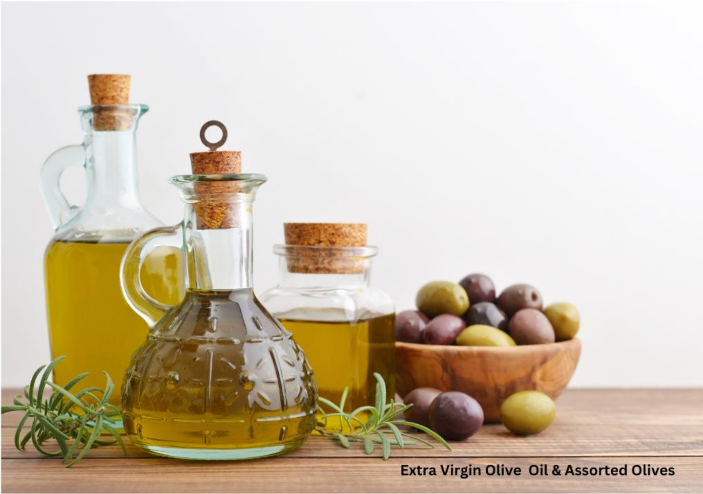
Extra Virgin Olive Oil & Assorted Olives

Elevate your everyday cooking with healthier cooking oil choices